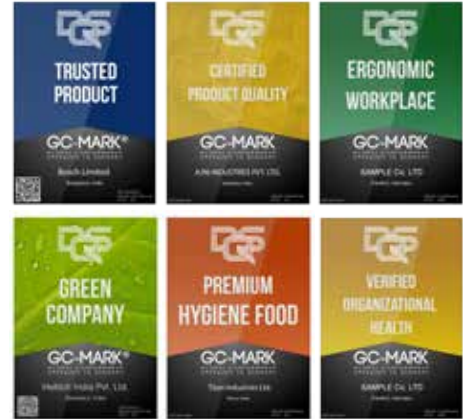
and many more labels...